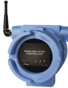
Explosion Proof Class I,II,III, DIV 1&2