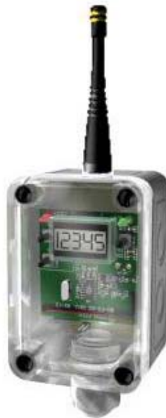
NEMA 4x Housing