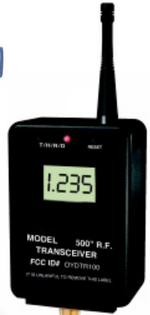
Panel & AC Wall Mount Housing