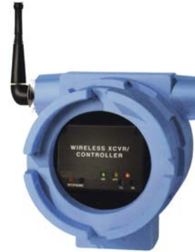
Explosion Proof Class I,II,III, DIV 1&2